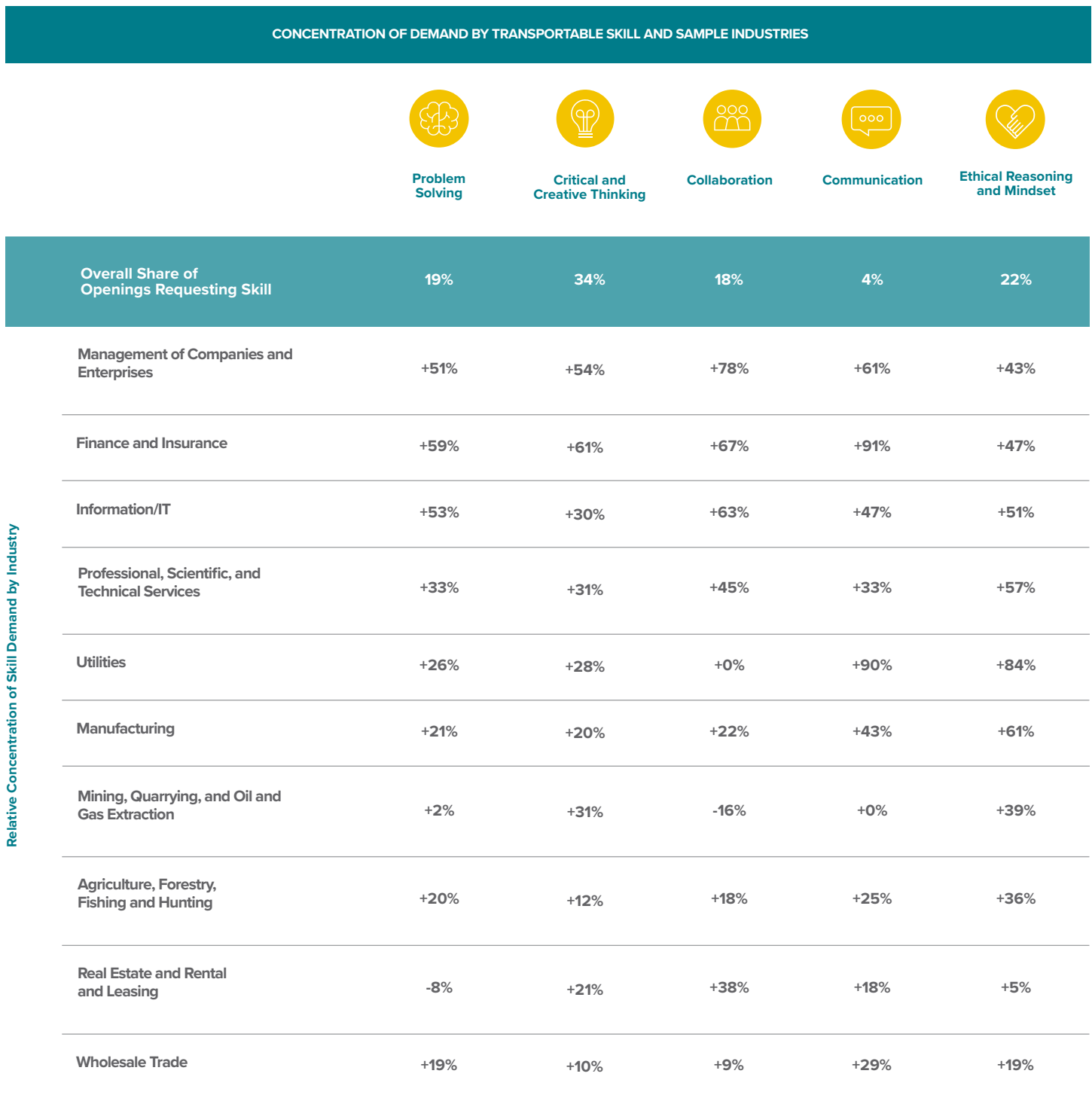
Table 4. Relative Industry Concentration of Demand by Transportable Skill

Relative Concentration of Skill Demand by Industry